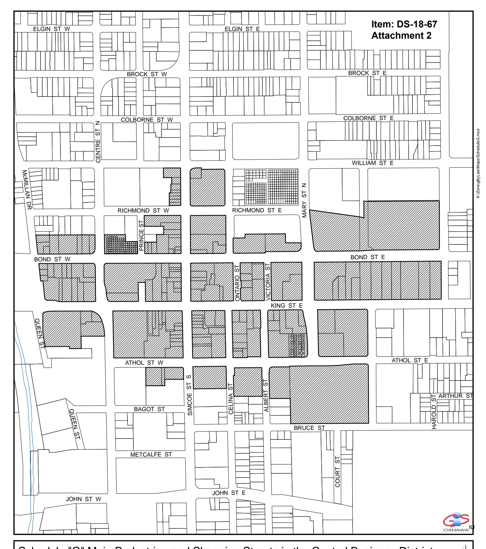
Schedule "G" Main Pedestrian and Shopping Streets in the Central Business District